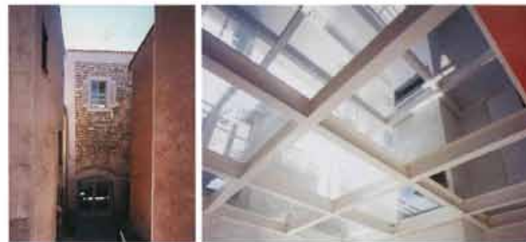
OPPOSITE Harajuku Church, Tokyo, Japan, 2005. Gueydan wanted to make this church a physical representation of elements of the Bible. The bell tower is incised with crosses down its entire length, making the exterior clearly recognizable as a place of worship, while the 13m-high ceiling is carved into six structural segments, flooding the chapel with light. Including the bell tower, these elements add up to seven, symbolizing the days of creation in Genesis. ABOVE Glass House, Mons, France, 2004. Floors in the multi-level house are made of clear glass; the exterior of the old stone house is retained. Concerned at first that the glass would be cold, Gueydan was pleased to discover that it conducted heat well. He likens the feeling to tatami (traditional Japanese floor coverings).

His modern metaphorical design reconstructs biblical imagery in concrete with a sheer finish. The challenge he faced was to avoid the cold and